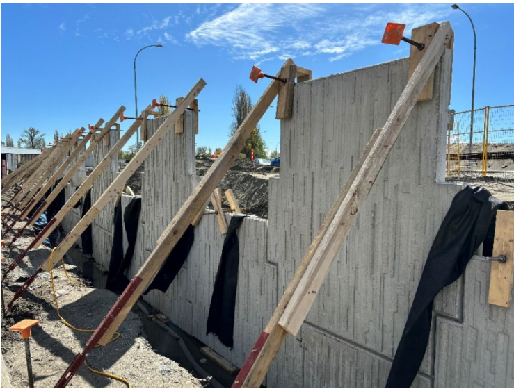
Image 3: Mechanically stabilized earth wall construction for northbound Highway 99 off-ramp