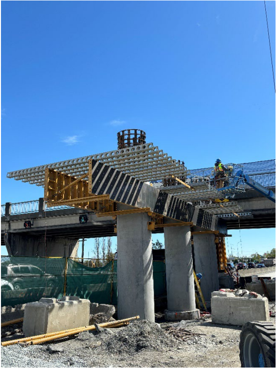
Image 2: Building elevated work platform in preparation for pier cap construction – NW quadrant