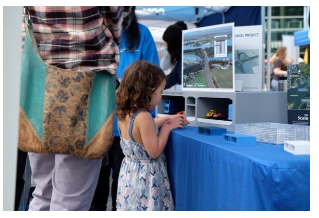
Child engaging with 3-D Fraser River Tunnel concept model.