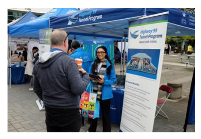
Team member talking to a Surrey resident at Surrey Fest.

Our community events are in full swing. We've been popping up at events across Delta, Richmond and Surrey, with more to come this summer. If you don't see us near you, you can always visit us at our community office at 5180 Ladner Trunk Road (beside Save On Foods) on Wednesdays and Thursdays.