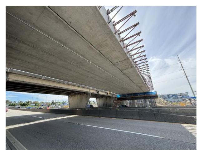
Newly installed Phase 1 girders spanning Highway 99.

If you've driven along Highway 99 through Richmond in June, you will have seen the new Steveston Interchange coming to life.