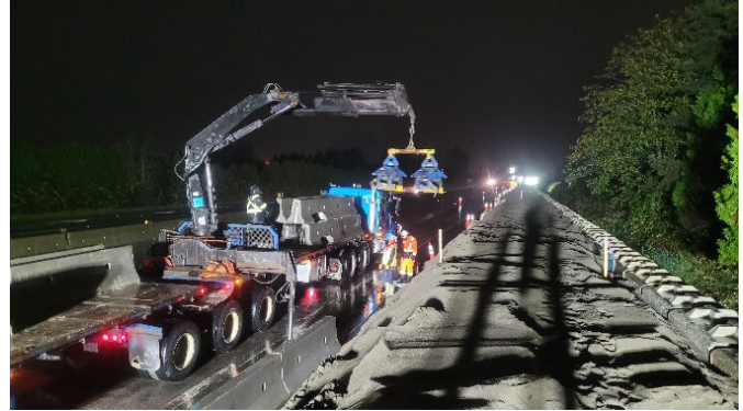
Figure 2: Installing concrete barriers along Highway 99 in Richmond to contain the preload material (October 2024).