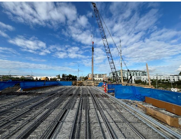
Figure 2: Preparation for rebar placement on the Phase 1 overpass deck underway.