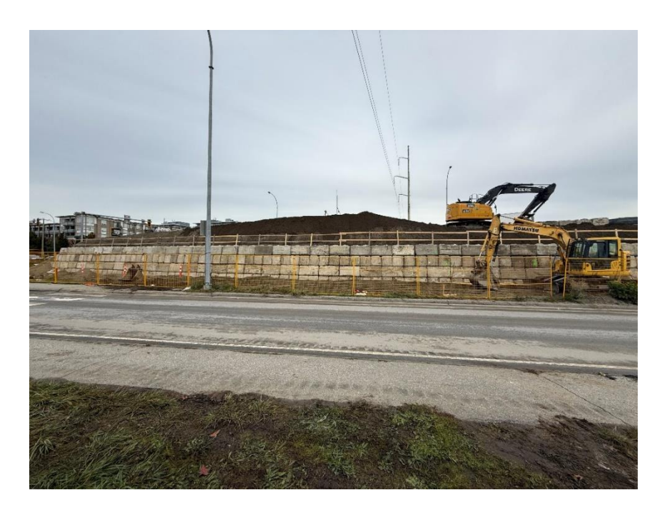
Figure 3: Preload placement in the southwest quadrant, with a temporary retaining wall in place.