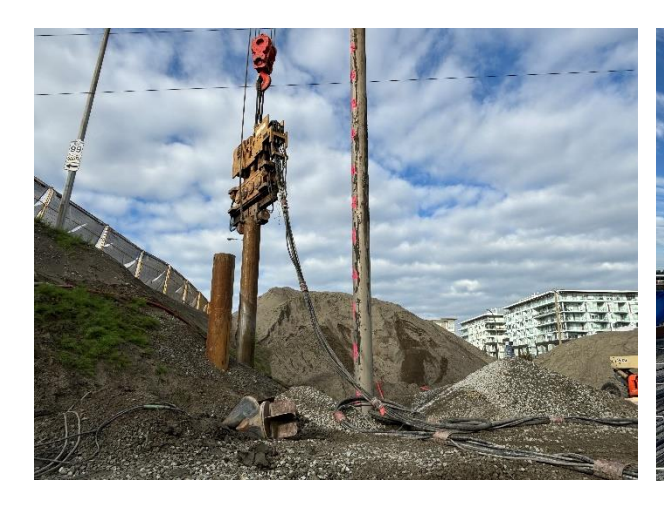
Figure 1: Impact hammer installing stone columns in the northwest quadrant.