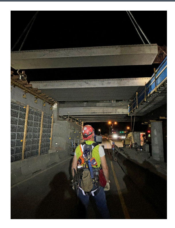
Image 1: Workers manoeuver east side end-span girders into position on the Phase 1 overpass.