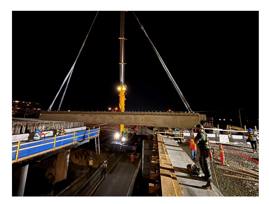
Image 3: A heavy-lift crane hoisting an end-span girder into position between the main-span girders and the northeast abutment.