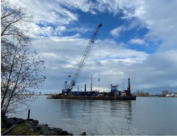
Figure 1: Geotechnical investigations in the Fraser River carried out on a barge.