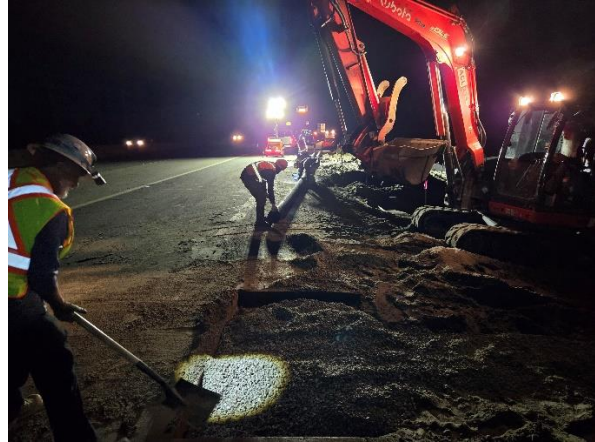
Figure 2: Overnight preloading of soil along Highway 99 to minimize impacts to highway users.