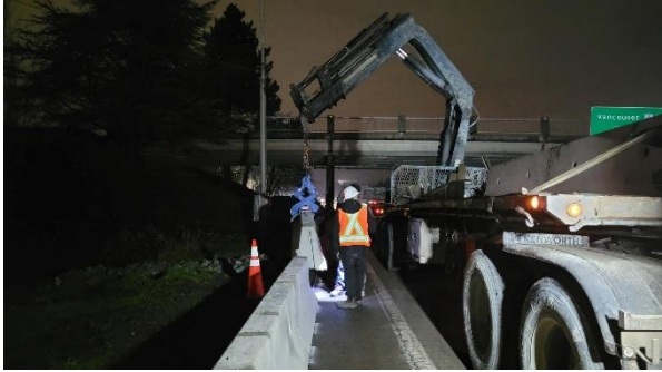
Figure 1: Crews move concrete barriers into place along Highway 99 in Richmond to contain the preload material.