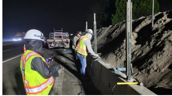
Figure 2: Crews inspect preload material along Highway 99 in Richmond.