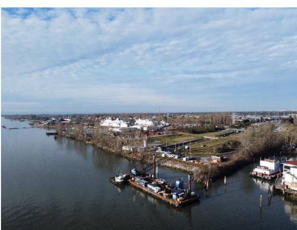
Figure 2: Marine geotechnical investigations work being conducted in the Fraser River near the George Massey Tunnel.